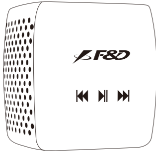
W4 User manual